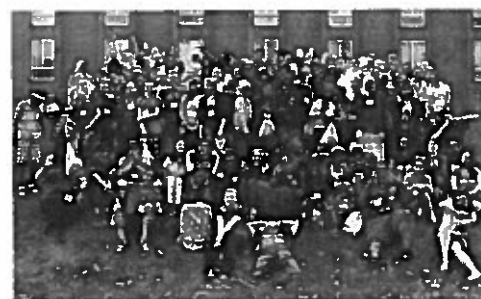
4-H@UMaine statewide youth conference led by EYSC youth.

life, more students are eating from the salad bar, tasting new foods and having pride in their school through the garden project. ■